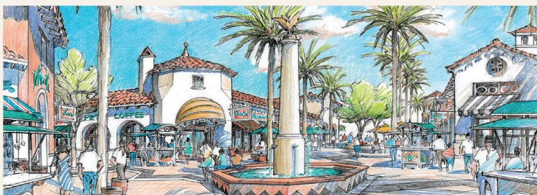
Artist's Rendering of University Village Shops

Miromar Development will open University Village Shops this winter at the southern end of Ben Hill Griffin Parkway, offering a diverse collection of restaurants, boutiques and health and beauty retailers.