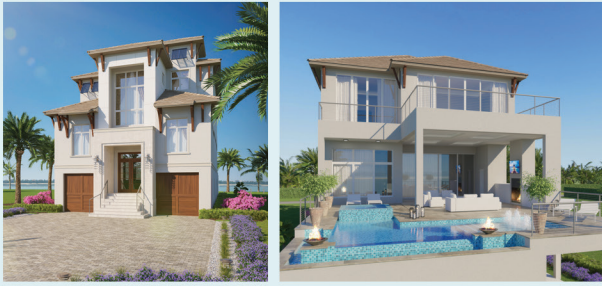
The "Sabbia" model will be built by Seagate Development Group

Two new waterfront model homes soon will be under construction in Sardinia, which offers luxury three-story residences reflecting quintessential Florida beachfront living.