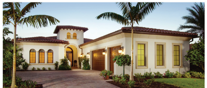
The "Carina" model

The Cilento is the largest model at 4,266 square feet under air and 6,280 total square feet. It features 4 bedrooms, 4 bathrooms and a library.