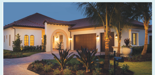
The "Benita" model