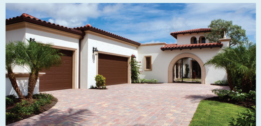
The "Cilento" model