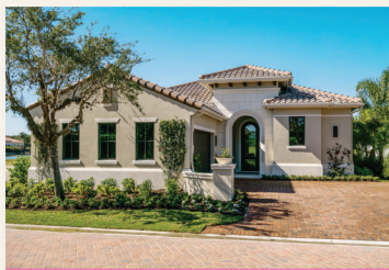
The "Oakmont" model

The first two waterfront homes have been completed in Villa d'Este, a privately gated enclave of 12 luxury golf villas.