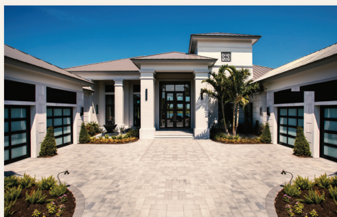
The "Hemingway" model is open in Sorrento