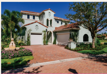
The "Highlands" model