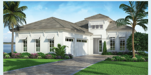
The "Avila" model

Benita (two models) luxury villa in Portofino: Built by London Bay Homes, the Benita has 3 bedrooms and 3½ bathrooms. Two models are available: one floorplan has 3,171 square feet under air and 4,662 total square feet, while the other has 3,102 square feet under air and 4,554 total square feet.