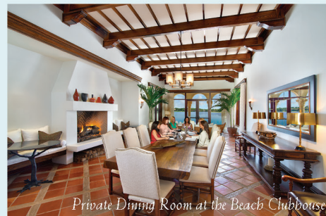
Private Dining Room at the Beach Clubhouse

Please call the Concierge Desk at (239) 489-2582 to join our Platinum Plan and experience all that Miromar Lakes has to offer!