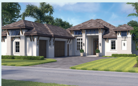
The "Tortola" model

Two additional model homes are under construction and available for immediate purchase: